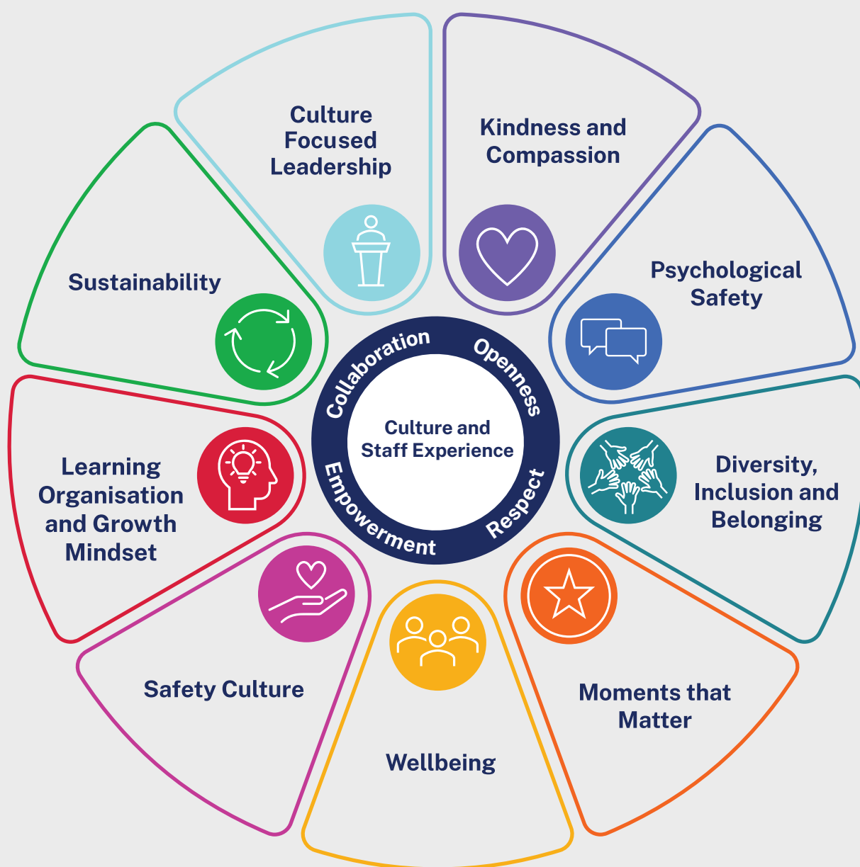
Figure 2 – Culture and Staff Experience Framework

Practical tools and resources aligned to these levers can be accessed through the NSW Health Culture and Staff Experience Hub .