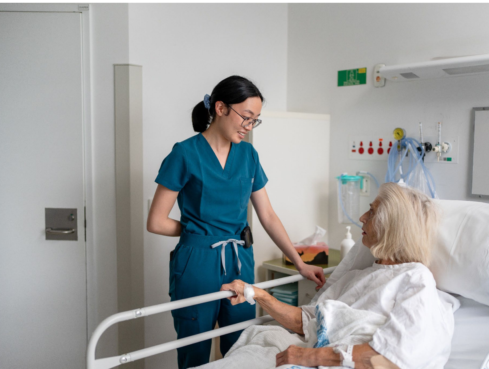
Liverpool Hospital - Tiffany

Your circumstances will be assessed to determine if a repayment is required.