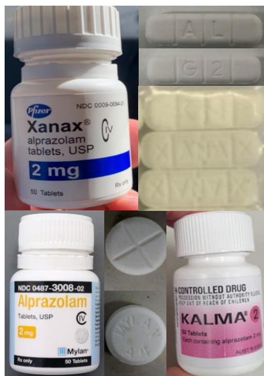
Photos of some of the counterfeit alprazolam products seen in NSW

Counterfeit alprazolam in NSW rarely contains alprazolam. These products contain other drugs (mostly unregistered benzodiazepines) in variable combinations and dosages.