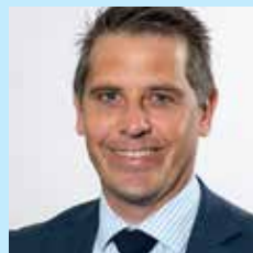
The Hon. Ryan Park, MP Minister for Health, Minister for Regional Health