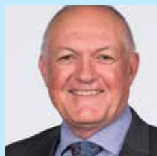
The Hon. David Harris, MP Minister for Medical Research