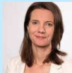
The Hon. Rose Jackson, MLC Minister for Mental Health